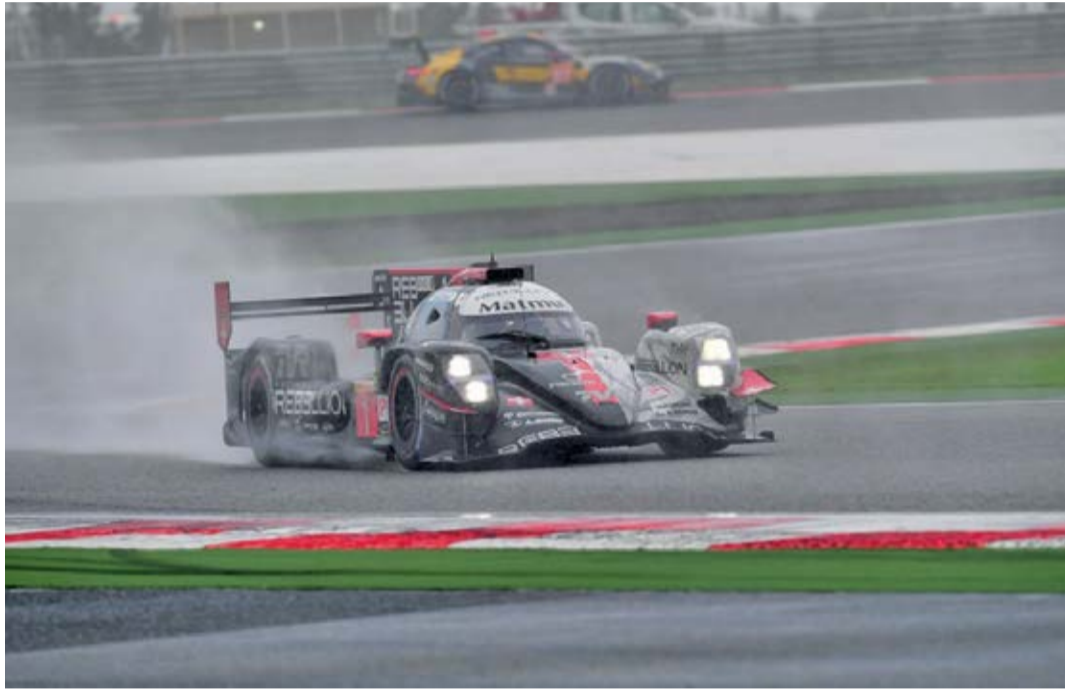
The Rebellion R13 tests at BIC in wet conditions