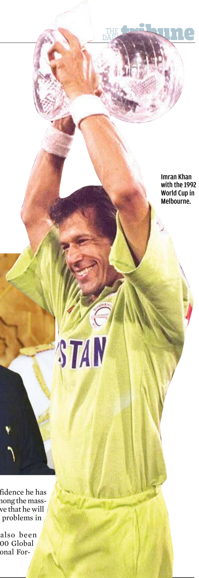
Imran Khan with the 1992 World Cup in Melbourne.

Imran Khan has also been featured in a list of '100 Global Thinkers' by international Foreign Policy magazine.