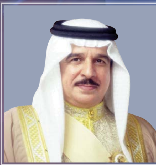
HIS MAJESTY KING HAMAD BIN ISA AL KHALIFA THE KING OF BAHRAIN