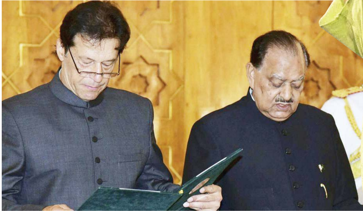
Imran Khan swearing in as the 22nd prime minister of Pakistan.

been paved and by 2018, Imran became the nation's Prime Minister. In terms of politics, it was a rapid rise but it's not likely to have taken the man himself by surprise.