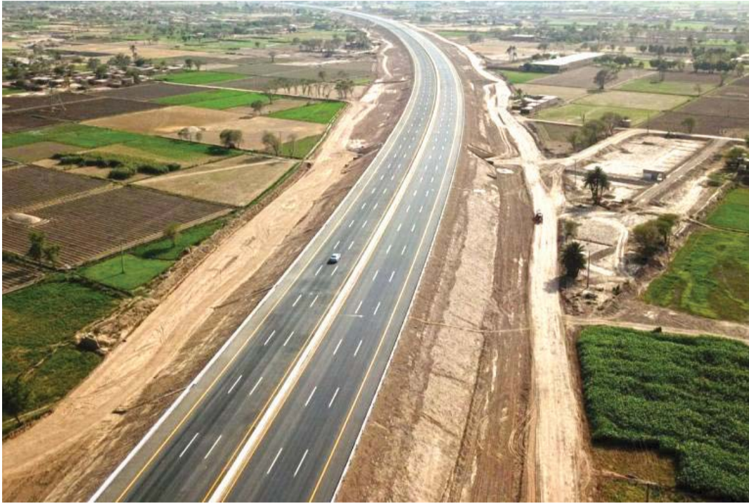
CPEC is key to Pakistan's year for achieving sustainable growth.

Pakistan's economy is now heading in the right direction, may economists say