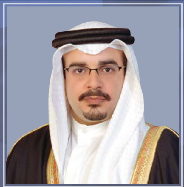
HIS ROYAL HIGHNESS PRINCE SALMAN BIN HAMAD AL KHALIFA THE CROWN PRINCE DEPUTY SUPREME COMMANDER & FIRST DEPUTY PRIME MINISTER