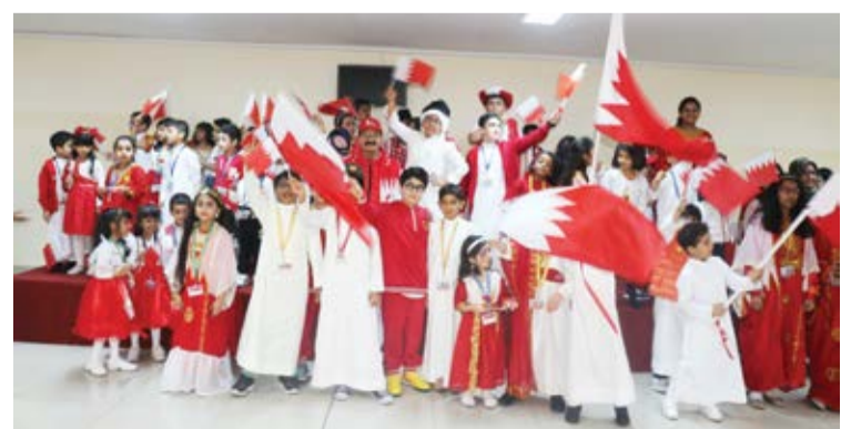
NMS-DPS students celebrating Bahrain National Day at its campus.

Children also shared the local sweets and confectionaries showcasing the glorious tradi-