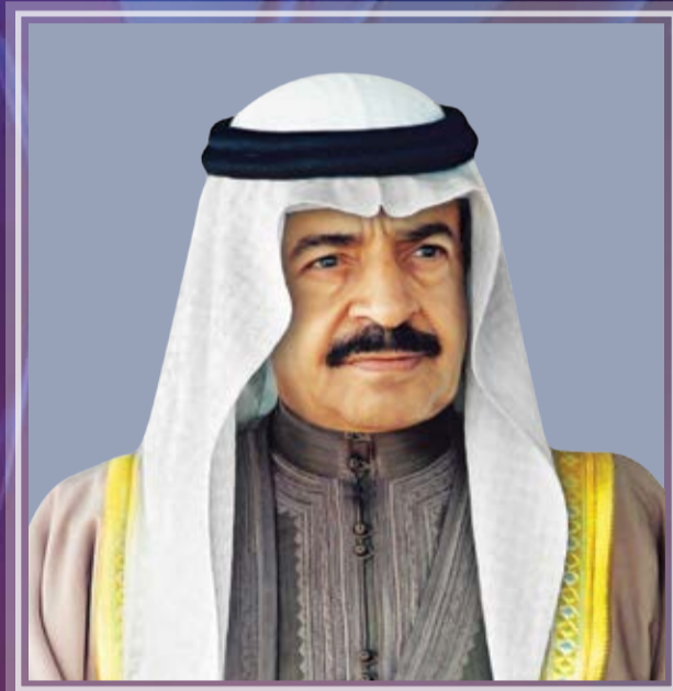
HIS ROYAL HIGHNESS PRINCE KHALIFA BIN SALMAN AL KHALIFA THE PRIME MINISTER