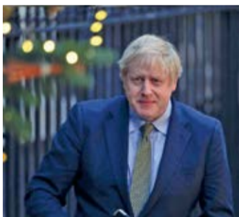
Britain's Prime Minister Boris Johnson

Johnson and his team were triumphant last week when he won a commanding majority of 80 at an early election he said he was forced to call to break the Brexit deadlock. Winning over many traditionally Labour