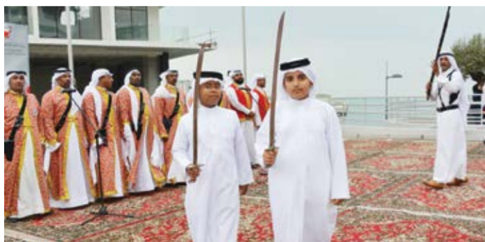
Children perform Ardah at an event organised by the Ministry of Industry, Trade and Commerce.

During the ceremony, the distinguished bilateral relations between the Kingdom of Bahrain and the friendly Republic of India were reviewed.