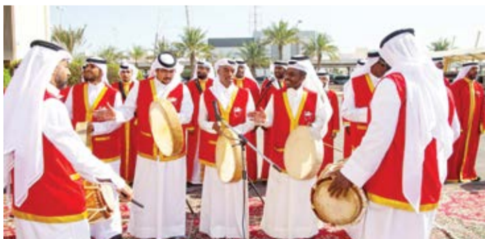
A traditional band performs at an event organised by the Information Ministry.