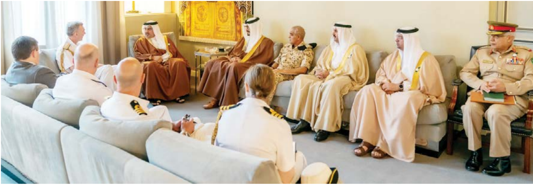
His Royal Highness Prince Salman bin Hamad Al Khalifa, the Crown Prince, Deputy Supreme Commander and First Deputy Prime Minister, yesterday met with Admiral Anthony Radakin, the United Kingdom's First Sea Lord and Chief of the Royal Navy Staff, at Riffa Palace. During the meeting, HRH the Crown Prince stressed that the long-standing strategic ties between the Kingdom of Bahrain and the United Kingdom continue to advance across all levels, to the benefit of both Kingdoms and their people. HRH the Crown Prince highlighted the deep-rooted ties between Bahrain and the United Kingdom, noting the strong level of bilateral co-operation between the two countries in promoting regional security and stability, including the joint participation in the International Maritime Security Construct. HRH the Crown Prince and Admiral Radakin also discussed regional and international issues of common interest.