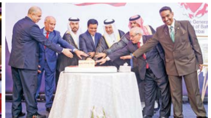
A cake-cutting ceremony was held at the Bahrain Consulate in Mumbai marking the occasion.

His Majesty also exchanged cables of congratulations with