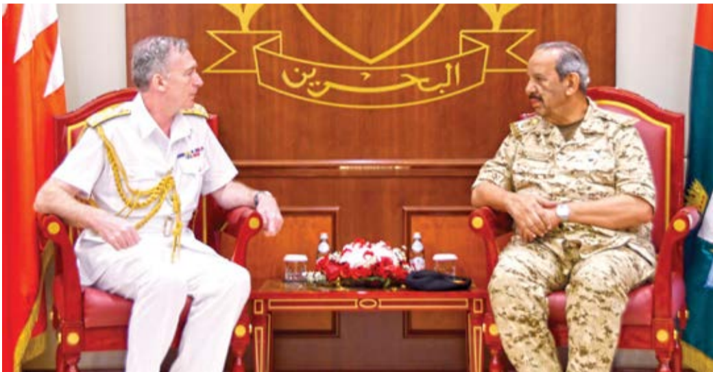
Commander-in-Chief of the Bahrain Defence Force (BDF), Field Marshal Shaikh Khalifa bin Ahmed Al Khalifa, received at the BDF's General Command yesterday, Admiral Anthony Radakin, the United Kingdom's First Sea Lord and Chief of the Naval Staff, and his accompanying delegation. Defence Affairs Minister, Lieutenant-General Abdulla bin Hassan Al Nuaimi, and Chief of Staff, Lieutenant-General Dheyab bin Saqr Al Nuaimi, were present. The commander-in-chief welcomed the UK Chief of the Naval Staff and his accompanying delegation, lauding the distinguished long-standing Bahrain-UK friendship relations, as well as the on-going cooperation between the two kingdoms in various fields, particularly regarding the exchange of expertise and military cooperation.