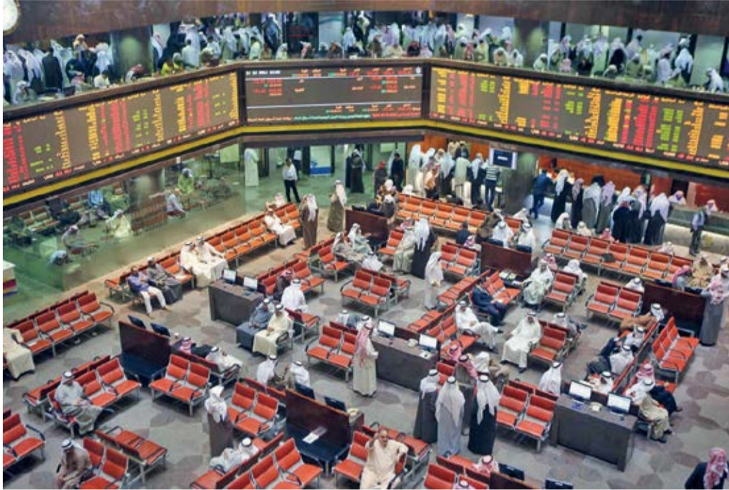
Traders on the floor of Saudi Stock exchange

Aramco will join the Tadawul index and global benchmarks such as MSCI and FTSE this week, which analysts said should fuel further demand, particularly