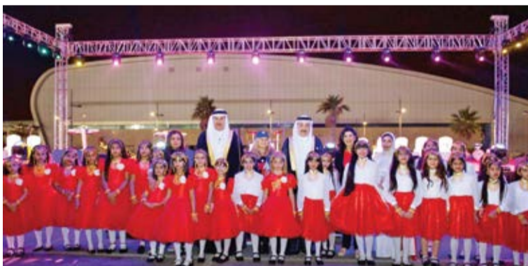
Labour Minister Jameel Humaidan and Labour Ministry Undersecretary Sabah Al Dossary at an event organised by 'This is Bahrain'.

His Majesty King Hamad bin Isa Al Khalifa last night received a telephone call from His Royal Highness Prime Minister Prince Khalifa bin Salman Al Khalifa.