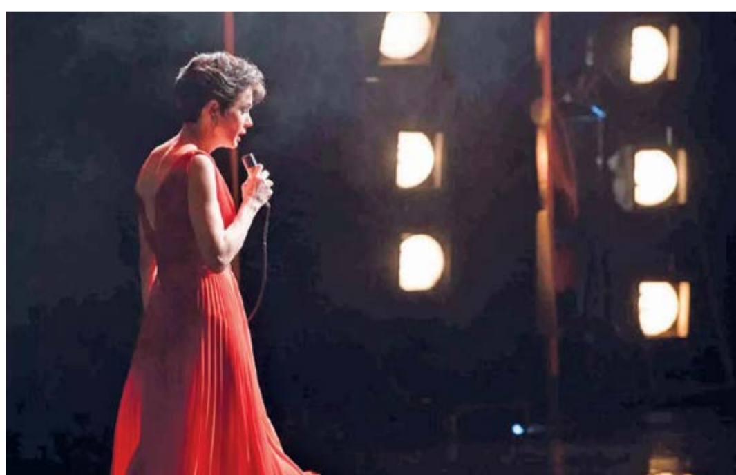
Renee Zellweger as Judy Garland in 'Judy'

In L.A., it's especially easy to see a celebrity, or someone with fame or riches, and assume they have it all figured out. But no one has it all figured out. That goes for the folks you see walking down the street, and it even goes for a superstar like Judy Garland. She seemed to be on top of the world. From 1939-1961, everyone wanted her beaming