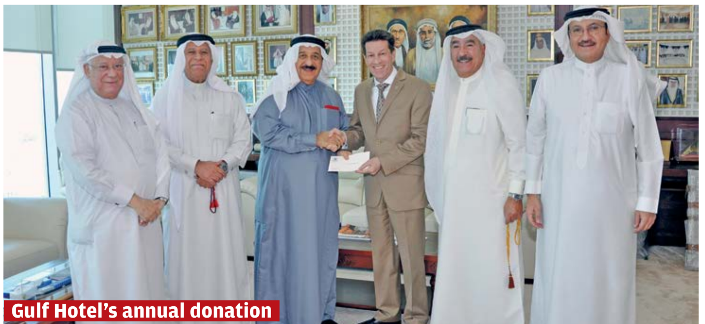
Gulf Hotel's annual donation

With its boutique business model, Gulf Air has started its fleet modernisation programme and has already received 7 new Boeing 787-9 Dreamliner and 5 new Airbus 320neo.