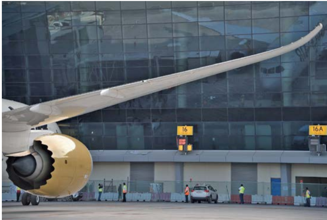
10 BIA airside stakeholders participated in the trials to test the operational and technical aspects of the new Multiple Aircraft Ramp System

One of the trials involved a Gulf Air B787 aircraft, which taxied to the new MARS Stand 16