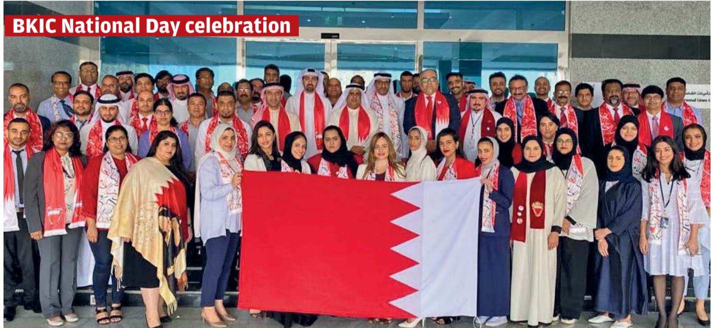
Employees of Bahrain Kuwait Insurance Company celebrate the National Day of Bahrain

Minister Prince Khalifa bin Salman Al Khalifa, and His Royal Highness Prince Salman bin Hamad Al Khalifa, Crown Prince, Deputy Supreme Commander and First Deputy Prime Minister further progress and prosperity.