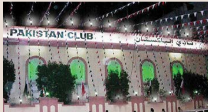
The community is commemorating the 48th Bahrain National Day celebrations with great fervour and enthusiasm at the Pakistan Club.

On behalf of the Pakistan club and its members, it gives me immense pleasure to extend warm greetings and felicitations to His Majesty, King Hamad bin Isa al Khalifa, His Royal Highness Prince Khalifa bin Salman Al Khalifa, the Prime Minister and His Royal Highness, Shaikh Salman Bin Hamad Al Khalifa, the Crown Prince, Deputy Supreme Commander in Chief and the First Deputy Prime Minister and to the brotherly people of Bahrain on the occasion of the National Day of the Kingdom of Bahrain.