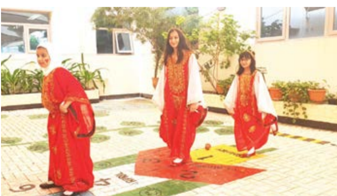
Many activities were held as part of the event.